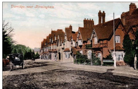
Station Approach, Dorridge