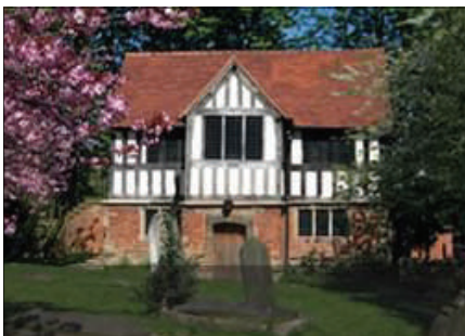
Kings Norton Grammar School