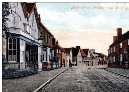
High Street & the Greswolde, early 1900s